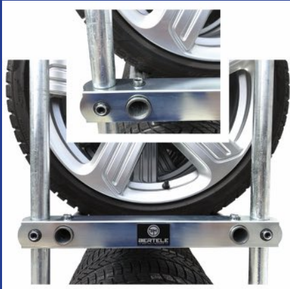
Gentle tire storage