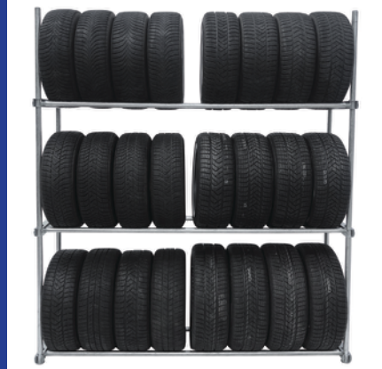
Rack width 2 meters - for 2 sets of tires