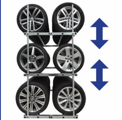
Infinitely height adjustable