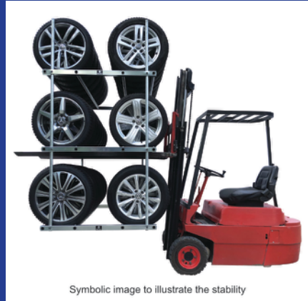
Extremely massive construction